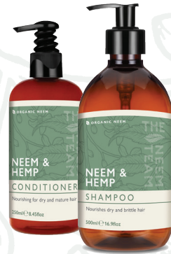
Neem & Hemp Nourishing dry hair

SHAMPOOS & CONDITIONERS Made with organic neem oil and the mildest plant-derived cleaning agents, our gentle, neem-based shampoos and conditioners soothe scalps, great for controlling dandruff and leaves hair cleansed and nourished. No artificial colourants, parabens or harsh detergents like SLS, SLES, and never tested on animals.