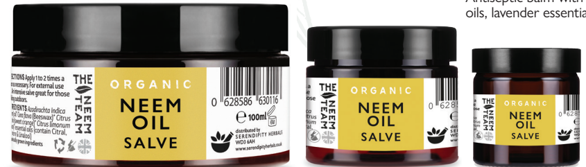
Organic neem oil salve Pure organic neem oil and organic unbleached beeswax.