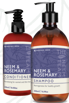
Neem & Rosemary Stimulating hair growth