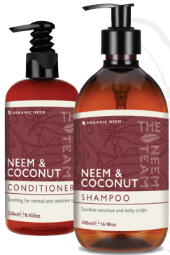
Neem & Coconut Soothing itchy and dry scalps