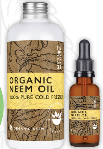
Organic Cold-pressed Neem Oil

The Neem leaf has ANTI-INFLAMMATORY, ANTI-BACTERIAL, ANTI-VIRAL and ANTI-FUNGAL properties