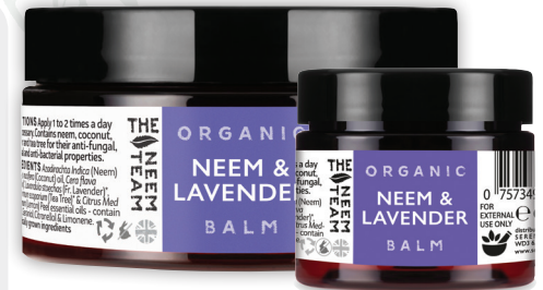
Neem & Lavender balm Antiseptic balm with neem and coconut oils, lavender essential oil and beeswax.

SALVES & BALMS an intensive treatment, great for gardeners, sports enthusiasts and challenging work environments. Protects skin against the elements, hydrating and healing chapped and chafed skin and treating nail infections, athlete's foot and runners' itch. Also good for minor cuts, grazes, acne and insect bites.